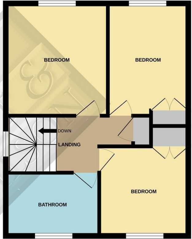
TOTAL FLOOR AREA : 914 sq.ft. (84.9 sq.m.) approx.

Whilst every attempt has been made to ensure the accuracy of the floorplan contained here, measurements of doors, windows, rooms and any other items are approximate and no responsibility is taken for any error, omission or mis-statement. This plan is for illustrative purposes only and should be used as such by any prospective purchaser. The services, systems and appliances shown have not been tested and no guarantee as to their operability or efficiency can be given. Made with Metropix ©2023